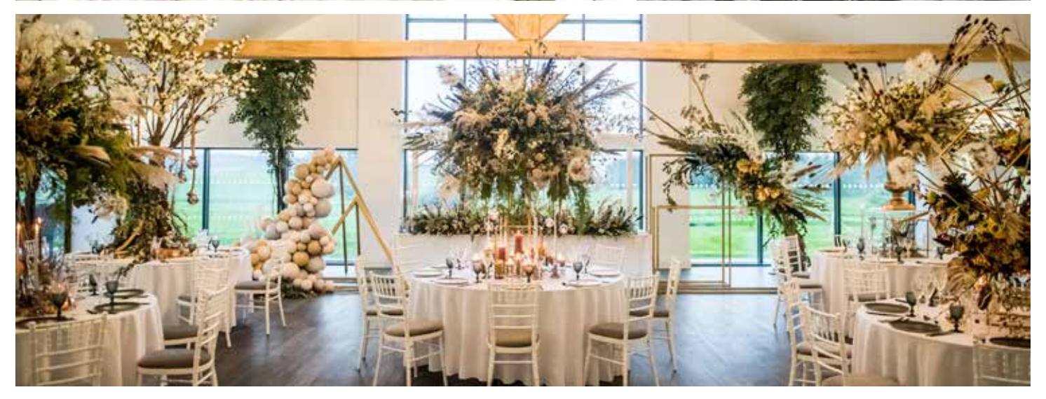
The First Look...

Before guests are welcomed in for the reception, we will bring you both in for the 'first look'. This is your private moment together to appreciate the transformation of the venue and to check the set up is as you dreamed. We are very proud to say we've never had a disappointed couple and every wedding we've hosted has reflected each couple's beautiful and unique vision perfectly.